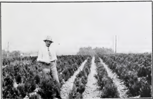
Retinospora Pisifera Aurea , 1 to 1½ ft.